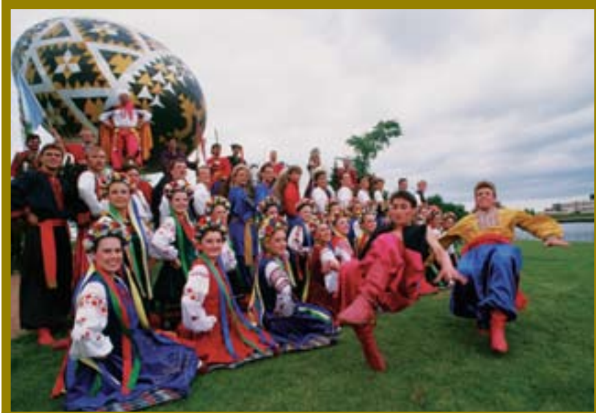
The Pysanka festival in Vegreville, Alberta, has been held each July since 1973 and celebrates Ukrainian culture through music, dance, and food. Pictured here are Ukrainian dancers performing in front of the world's largest pysanka, or Easter egg, at the festival.