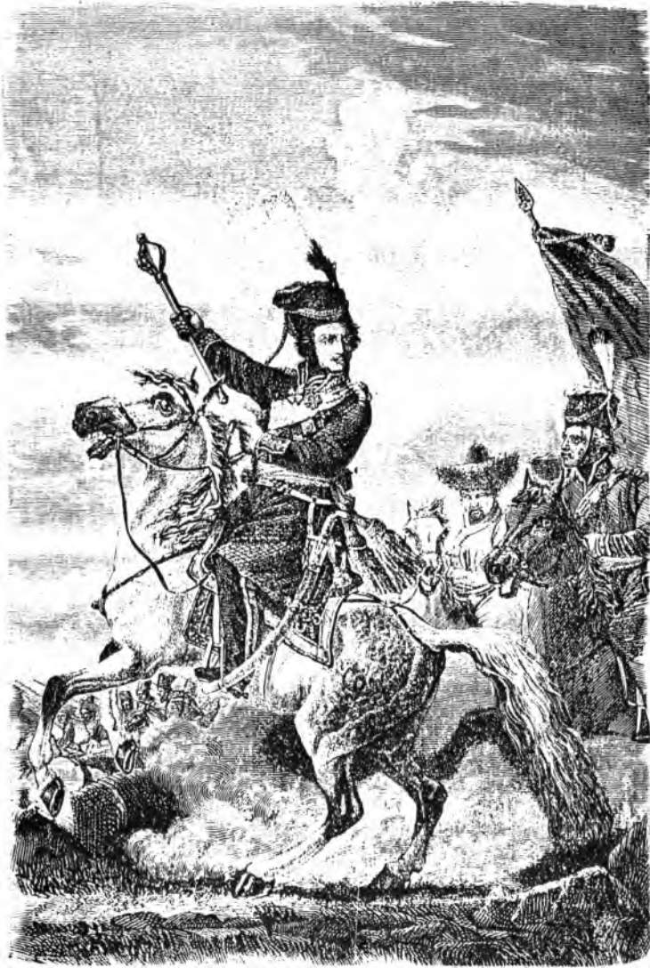
THE HETMAN PLATOV