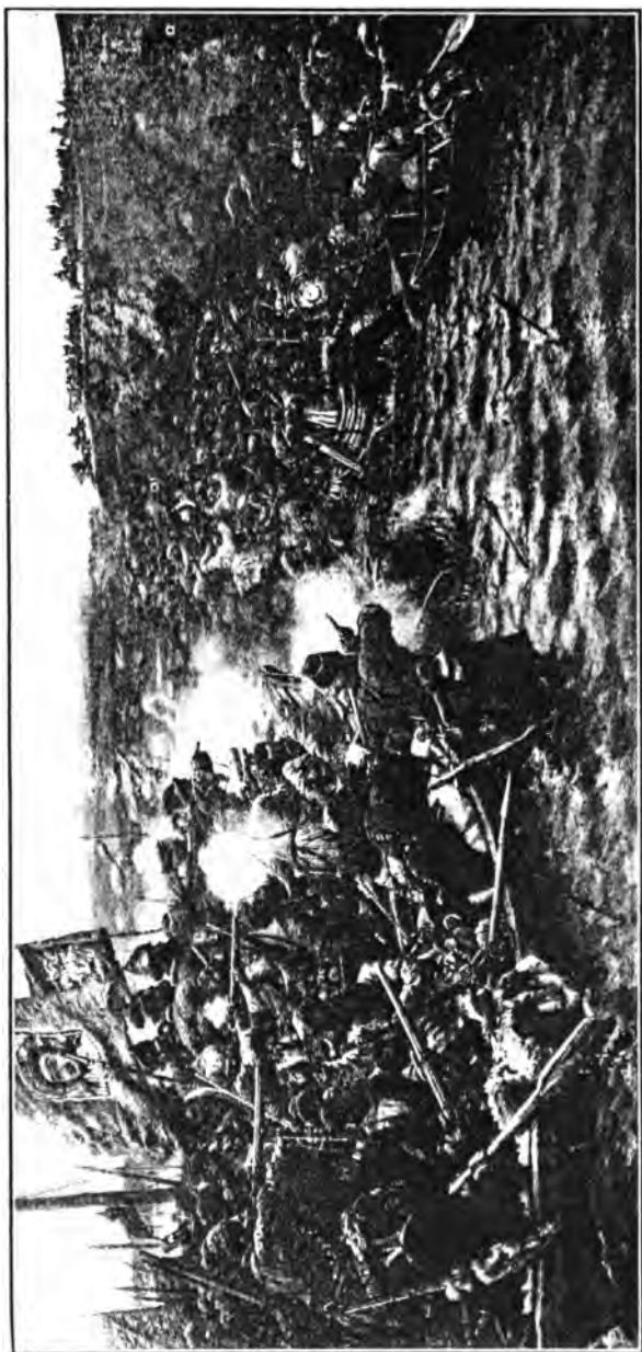
YERMAK'S MARCH IN SIBERIA