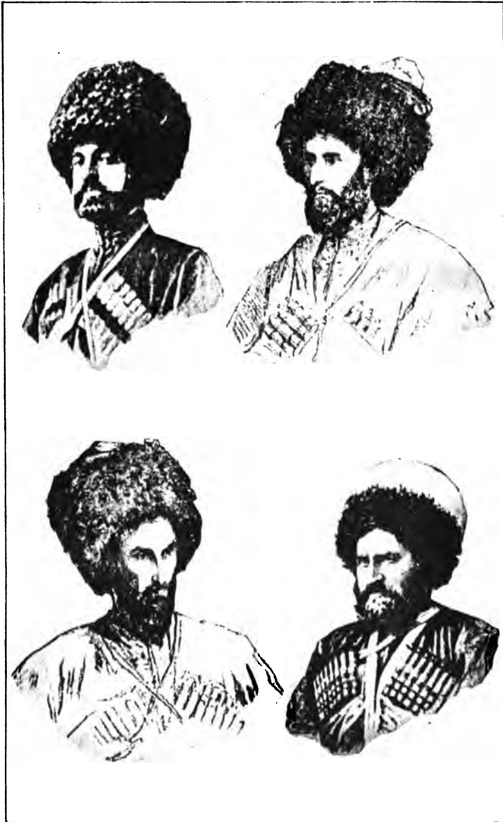
KOUBAN COSSACKS And "Cossacks" of the "Wild Division"