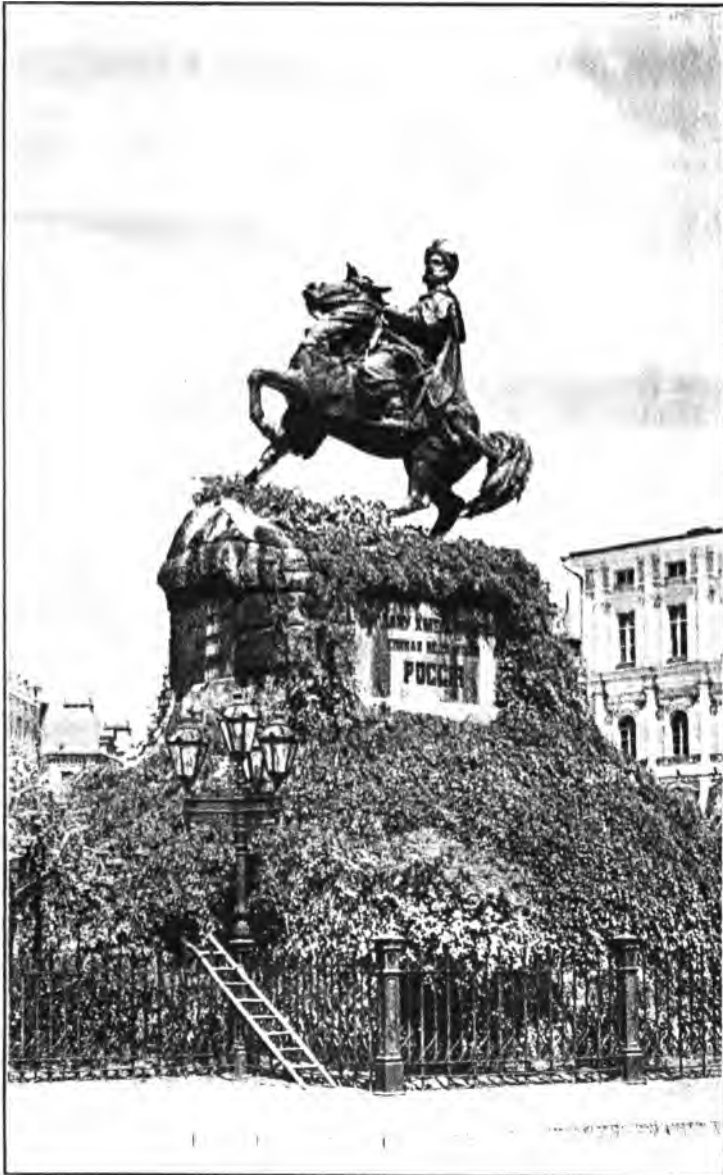
STATUE OF BOGDAN